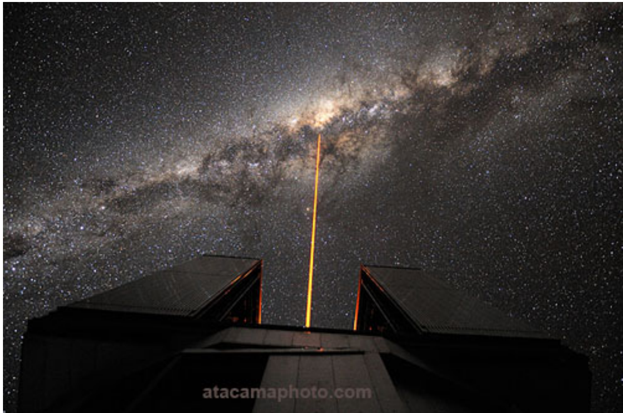
Laser indicating location of Galactic Center

This means that during every Winter Solstice in the immediate future, we will have increasing Galactic Center energies resonating with the Earth, which we can use for our spiritual evolution - but we must also consciously balance these energies, in order to use them safely and not be destabilized by them.